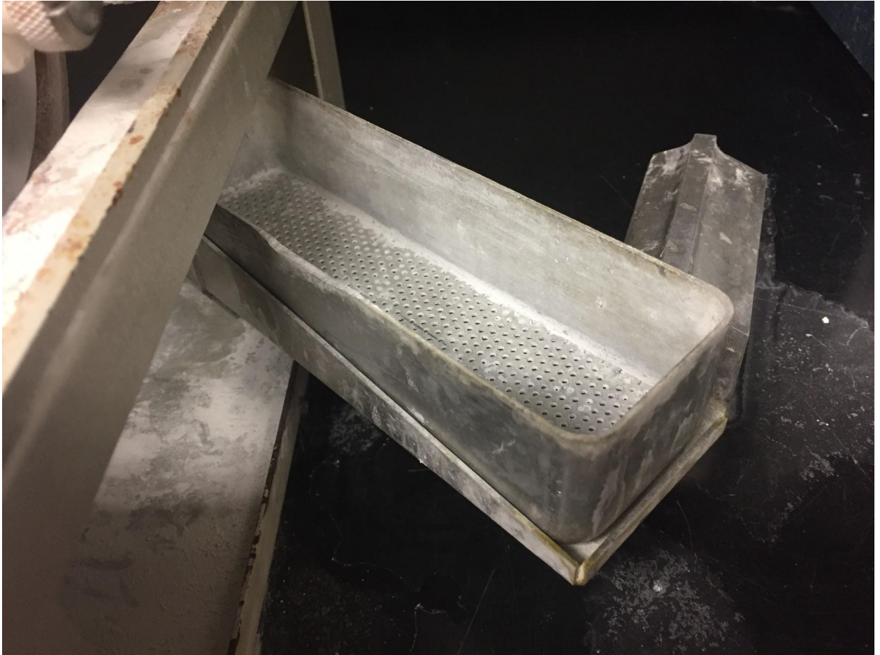
The water bath beneath the saw

Once this is completed, the bath can be jiggled back up into the ready position and propped by the aluminum block.