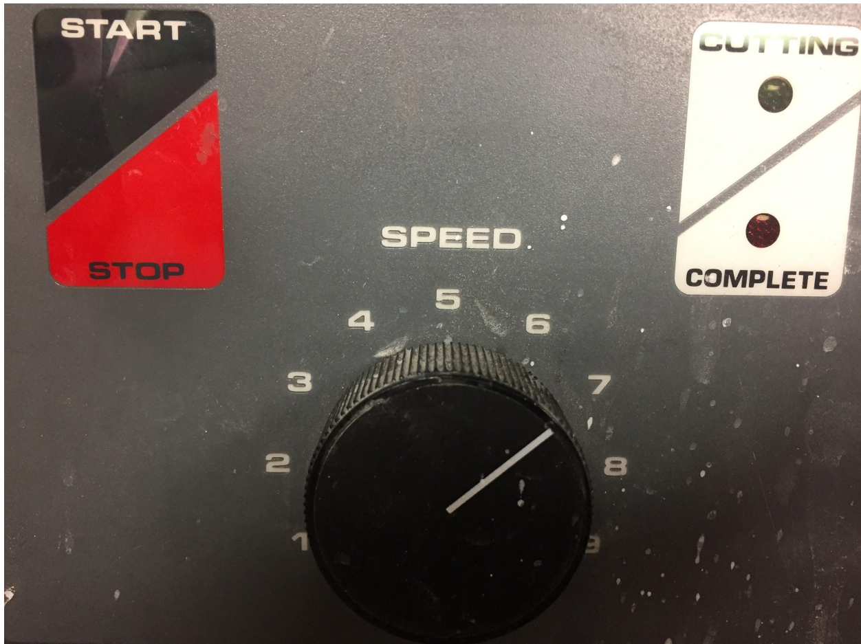
The control panel of the saw