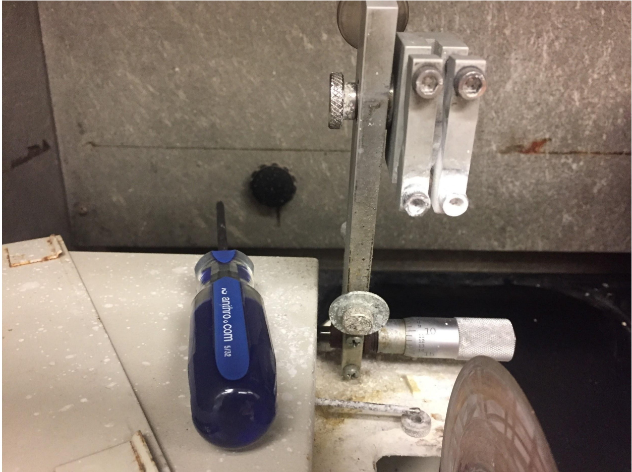
Saw arm with sample loading mechanism