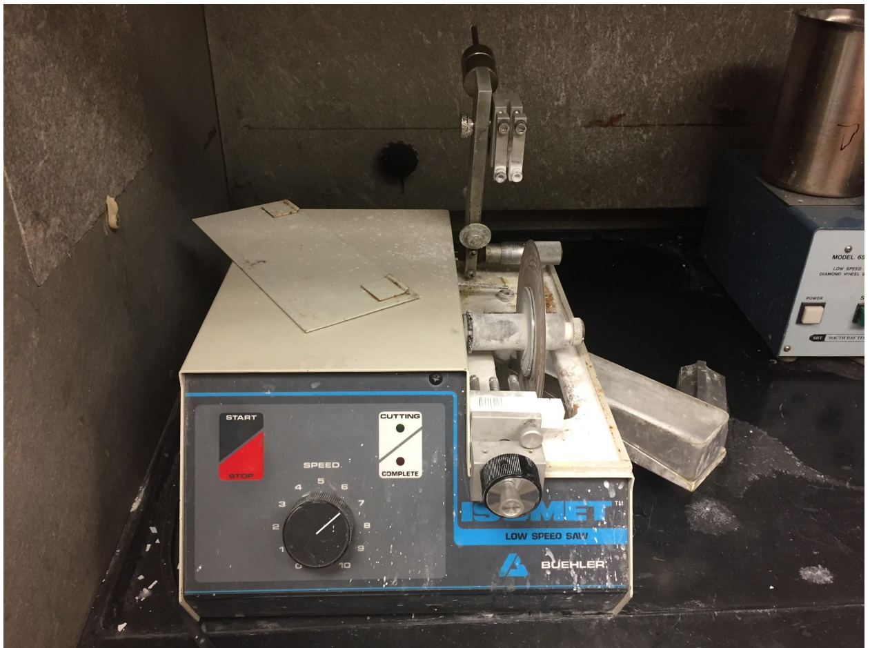
The IsoMet Buehler saw

In order to perform tests on the Instron or DSC, samples must be cut from the epoxy cylinders on the IsoMet Buehler saw in 130B. This manual details how to safely and precisely operate this piece of equipment for this purpose.