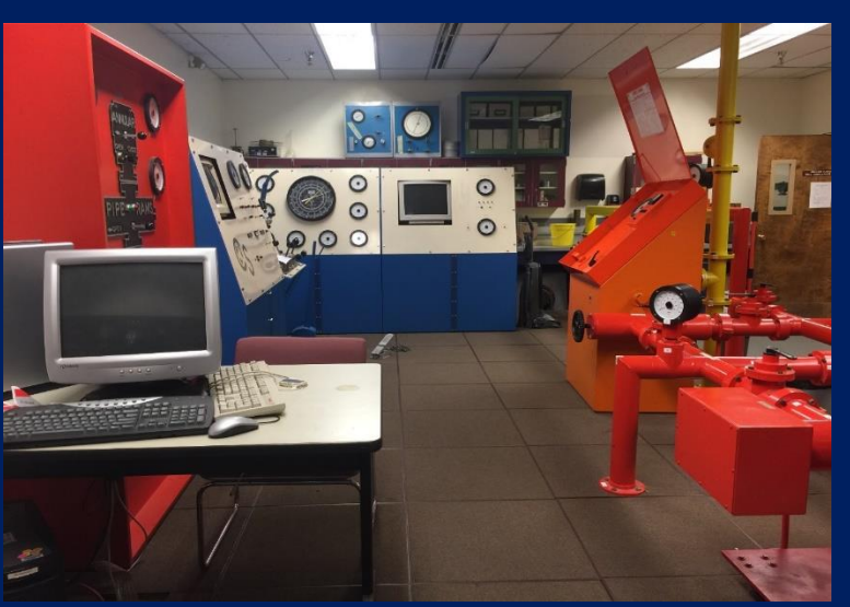
Full-size Drilling Simulator