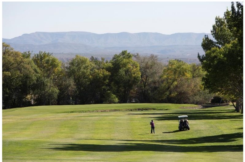
NMT's popular and beautiful golf course.

Nature lovers are drawn to Socorro and the surrounding area for its scenic beauty, fascinating wildlife, and outdoor recreation. During the winter, the Bosque del Apache National Wildlife Refuge is home to bald eagles and thousands of sandhill cranes and snow geese. Also, located just five miles from Socorro, Box Canyon is a popular site for camping, hiking, and rock climbing, and attracts both locals and knowledgeable visitors.